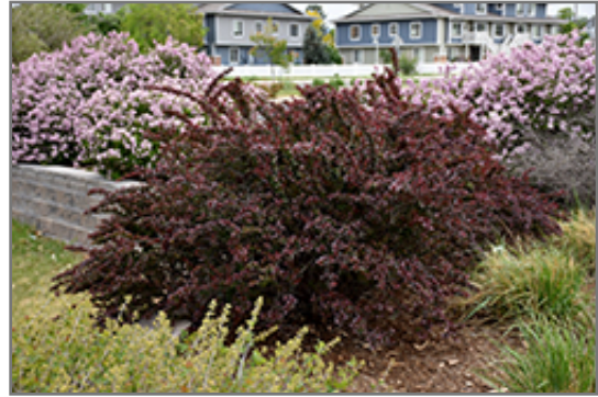
Red Leaf Japanese Barberry

Red Leaf Japanese Barberry is recommended for the following landscape applications;