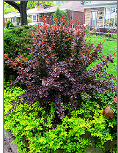
Red Leaf Japanese Barberry

Red Leaf Japanese Barberry is recommended for the following landscape applications;