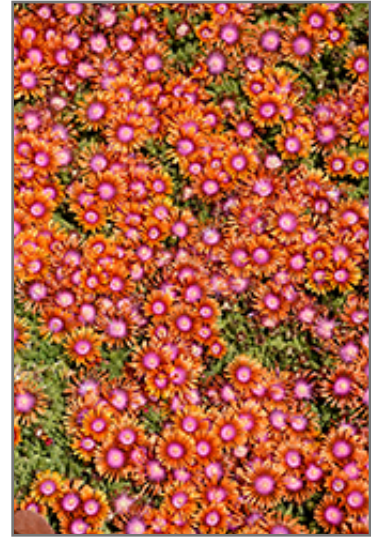
Fire Spinner Ice Plant flowers