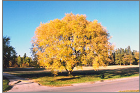
Boxelder in fall