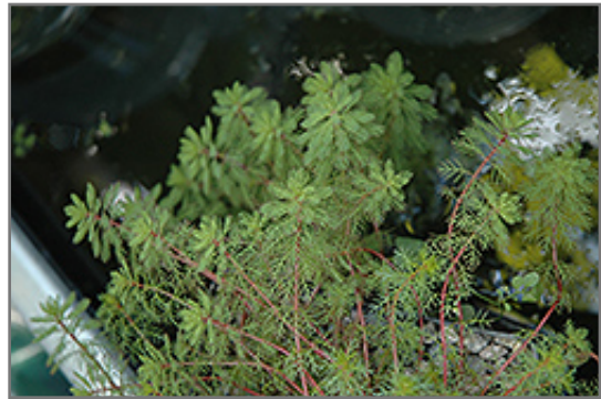
Red Stemmed Parrot Feather foliage