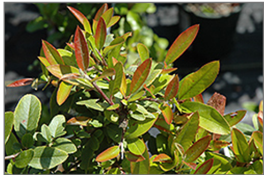
Orange Glow Scarlet Firethorn foliage