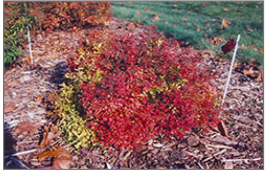
Dakota Goldcharm Spirea in fall

This shrub should only be grown in full sunlight. It prefers to grow in average to moist conditions, and shouldn't be allowed to dry out. It is not particular as to soil type or pH. It is highly tolerant of urban pollution and will even thrive in inner city environments. This is a selected variety of a species not originally from North America.