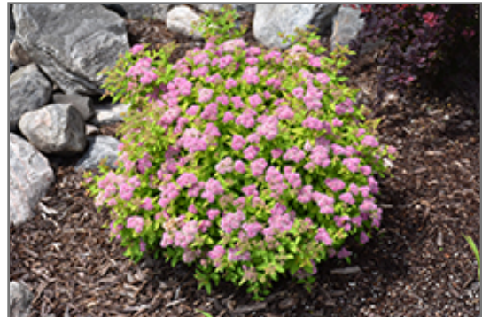
Dakota Goldcharm Spirea in bloom