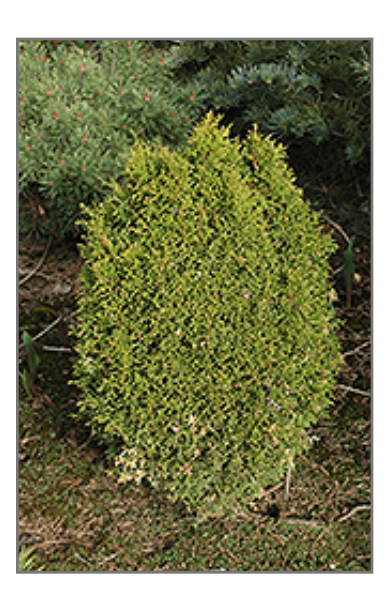
Boisbriand Arborvitae