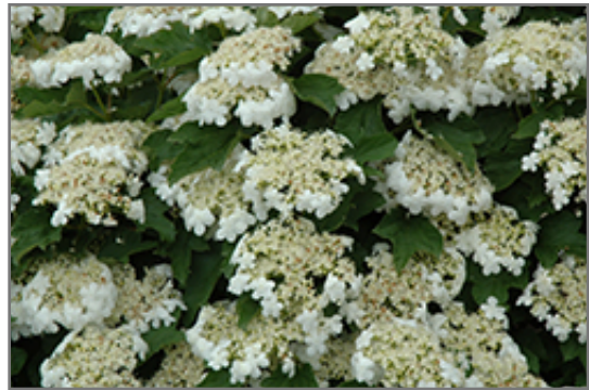
Compact European Cranberry flowers