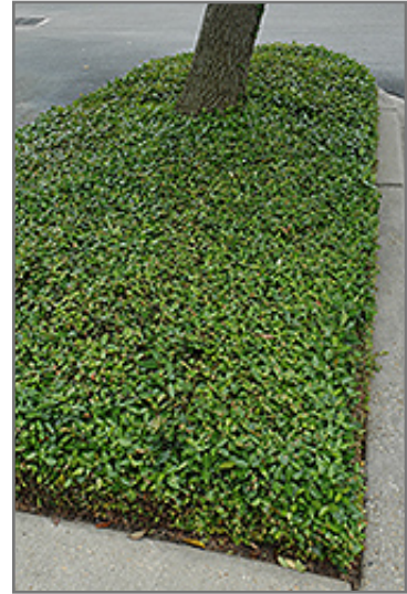
Asian Jasmine