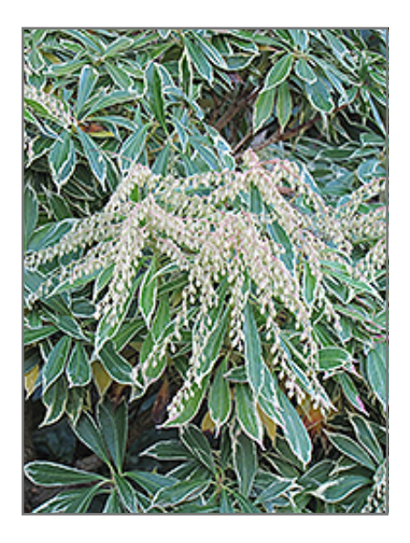
Variegated Japanese Pieris flowers