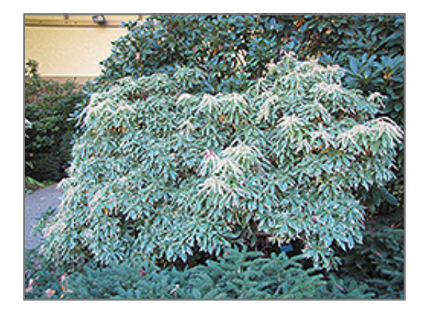
Variegated Japanese Pieris in bloom

56 Creek Road, Chatham, Ontario (519) 352-1127 www.glasshousenursery.ca