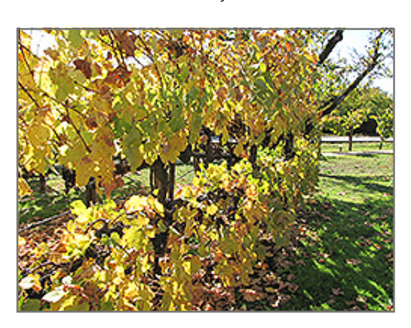
Merlot Grape in fall