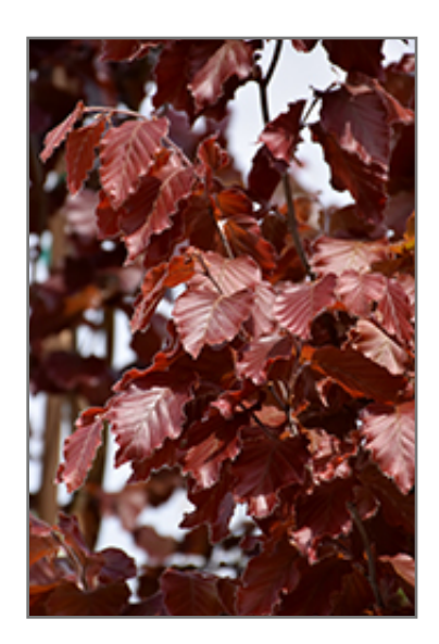
Red Obelisk Beech foliage