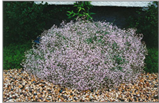
Pink Fairy Baby's Breath in bloom