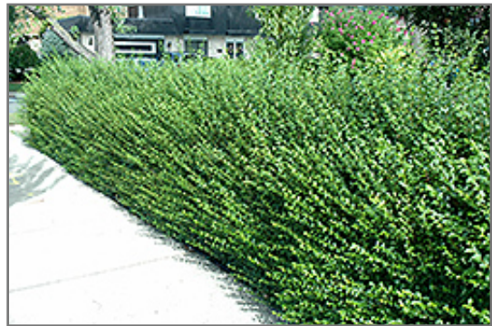
Amur Privet