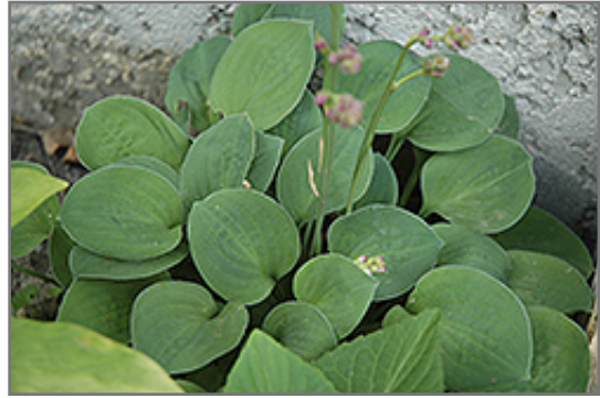
Baby Bunting Hosta foliage

Baby Bunting Hosta is recommended for the following landscape applications;