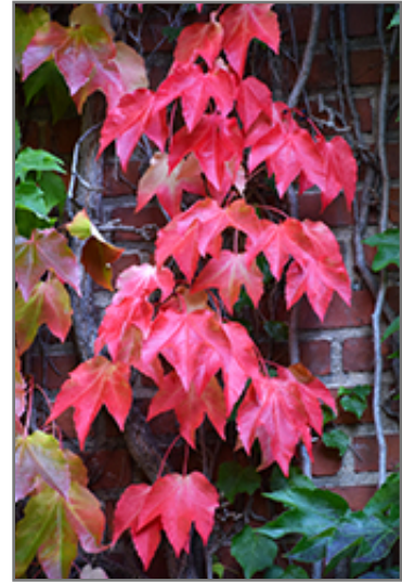
Boston Ivy in fall