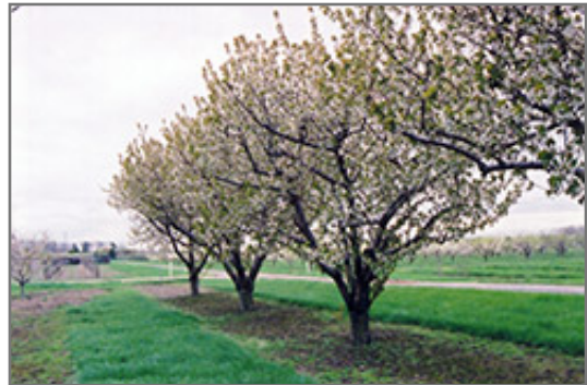
Sweet Cherry in bloom