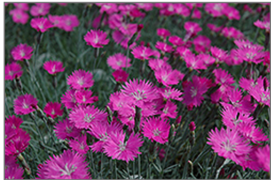
Firewitch Pinks flowers