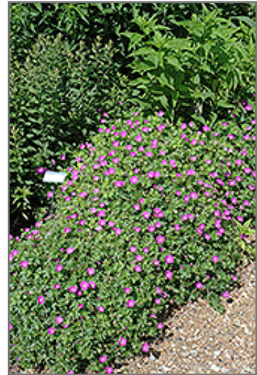
Max Frei Cranesbill in bloom