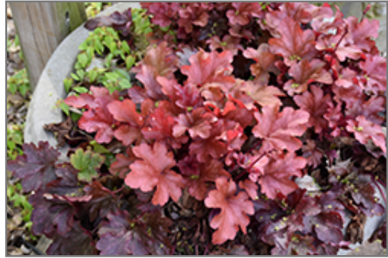
Peach Flambe Coral Bells

Peach Flambe Coral Bells is a fine choice for the garden, but it is also a good selection for planting in outdoor pots and containers. It is often used as a 'filler' in the 'spiller-thriller-filler' container combination, providing a mass of flowers and foliage against which the larger thriller plants stand out. Note that when growing plants in outdoor containers and baskets, they may require more frequent waterings than they would in the yard or garden.