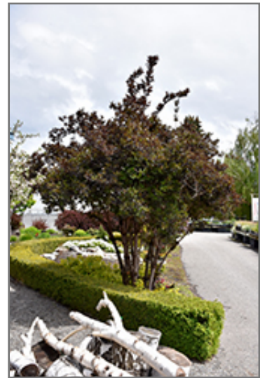
Black Beauty Elder