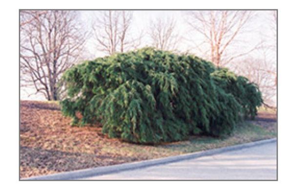
Sargent's Weeping Hemlock