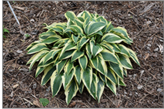
Wolverine Hosta

Wolverine Hosta will grow to be about 12 inches tall at maturity extending to 18 inches tall with the flowers, with a spread of 3 feet. When grown in masses or used as a bedding plant, individual plants should be spaced approximately 30 inches apart. Its foliage tends to remain dense right to the ground, not requiring facer plants in front. It grows at a medium rate, and under ideal conditions can be expected to live for approximately 10 years. As an herbaceous perennial, this plant will usually die back to the crown each winter, and will regrow from the base each spring. Be careful not to disturb the crown in late winter when it may not be readily seen!