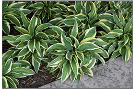
Wolverine Hosta