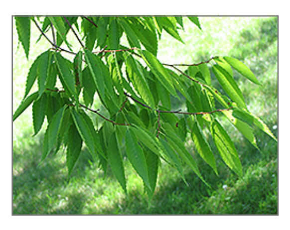
Japanese Zelkova foliage