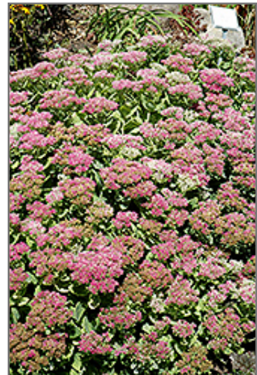
Brilliant Stonecrop in bloom