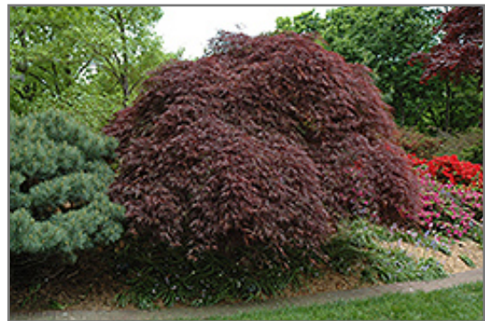
Red Select Cutleaf Japanese Maple