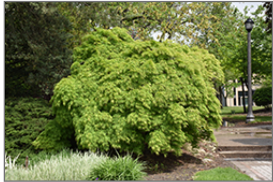
Cutleaf Japanese Maple