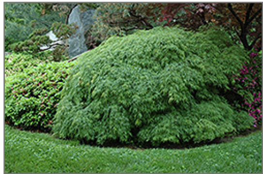
Cutleaf Japanese Maple