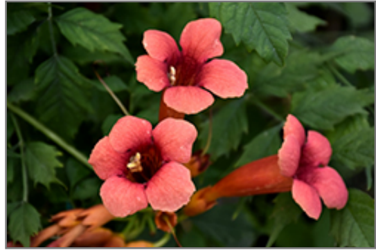
Flamenco Trumpetvine flowers