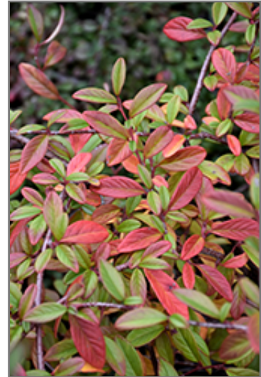
Scarlet Leader Willowleaf Cotoneaster in fall

* This is a 'special order' plant - contact store for details