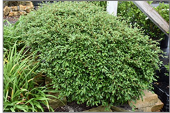
Scarlet Leader Willowleaf Cotoneaster

This shrub will require occasional maintenance and upkeep, and should not require much pruning, except when necessary, such as to remove dieback. It is a good choice for attracting birds to your yard, but is not particularly attractive to deer who tend to leave it alone in favor of tastier treats. Gardeners should be aware of the following characteristic(s) that may warrant special consideration;