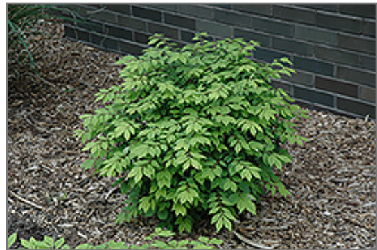
Little Moses Burning Bush