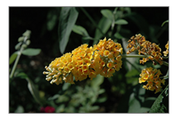
Honeycomb Butterfly Bush flowers

Honeycomb Butterfly Bush is recommended for the following landscape applications;