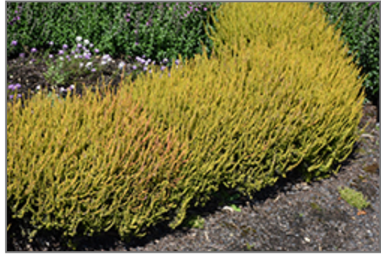
Firefly Heather

This shrub should only be grown in full sunlight. It requires an evenly moist well-drained soil for optimal growth, but will die in standing water. It is very fussy about its soil conditions and must have sandy, acidic soils to ensure success, and is subject to chlorosis (yellowing) of the foliage in alkaline soils. It is somewhat tolerant of urban pollution, and will benefit from being planted in a relatively sheltered location. Consider applying a thick mulch around the root zone in winter to protect it in exposed locations or colder microclimates. This is a selected variety of a species not originally from North America.