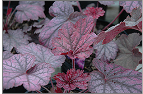
Midnight Bayou Coral Bells foliage

Midnight Bayou Coral Bells is recommended for the following landscape applications;