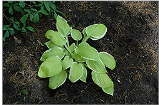
St. Elmo's Fire Hosta