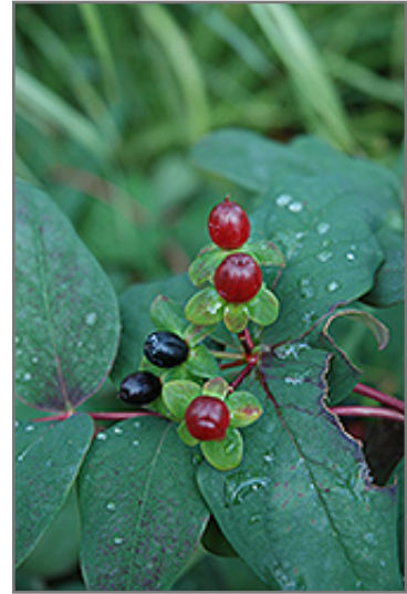
Albury Purple St. John's Wort fruit

Albury Purple St. John's Wort makes a fine choice for the outdoor landscape, but it is also well-suited for use in outdoor pots and containers. With its upright habit of growth, it is best suited for use as a 'thriller' in the 'spiller-thriller-filler' container combination; plant it near the center of the pot, surrounded by smaller plants and those that spill over the edges. It is even sizeable enough that it can be grown alone in a suitable container. Note that when grown in a container, it may not perform exactly as indicated on the tag - this is to be expected. Also note that when growing plants in outdoor containers and baskets, they may require more frequent waterings than they would in the yard or garden.