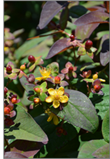
Albury Purple St. John's Wort flowers