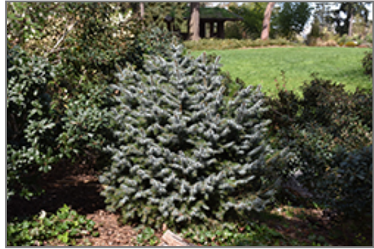
Papoose Dwarf Sitka Spruce