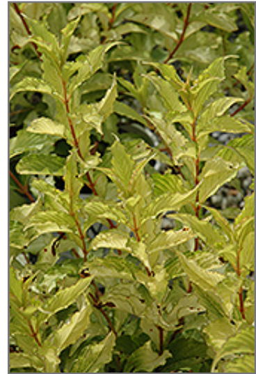
Ghost Weigela foliage