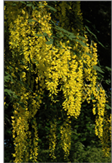
Weeping Laburnum flowers