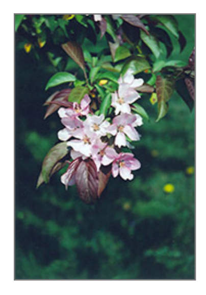
Red Splendor Flowering Crab flowers

56 Creek Road, Chatham, Ontario (519) 352-1127 www.glasshousenursery.ca