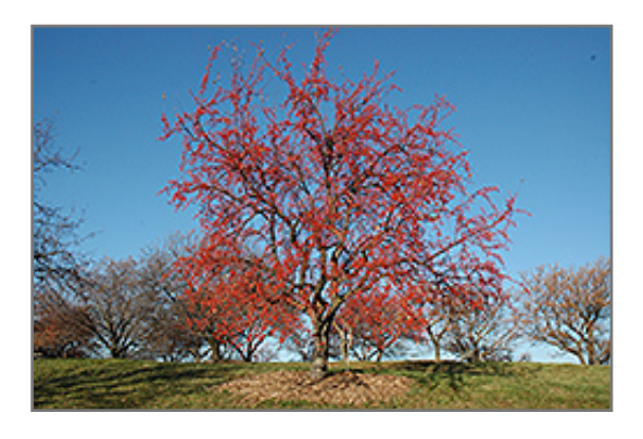
Red Splendor Flowering Crab in fall

This tree will require occasional maintenance and upkeep, and is best pruned in late winter once the threat of extreme cold has passed. It has no significant negative characteristics.