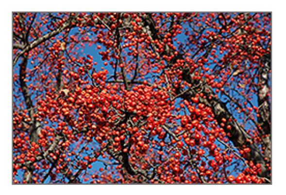
Red Splendor Flowering Crab fruit

* This is a 'special order' plant - contact store for details