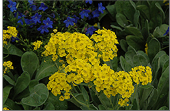
Basket Of Gold Alyssum flowers

Basket Of Gold Alyssum is recommended for the following landscape applications;