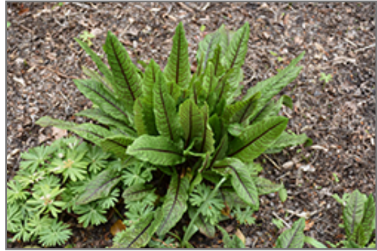
Ornamental Sorrel

Ornamental Sorrel is recommended for the following landscape applications;