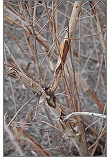
Diablo Ninebark bark

* This is a 'special order' plant - contact store for details