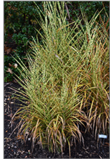
Gold Breeze Maiden Grass