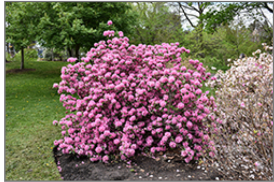
Aglo Rhododendron in bloom