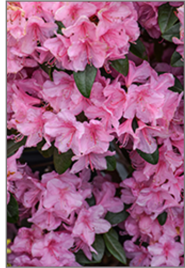
Aglo Rhododendron flowers