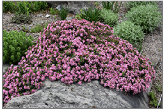
Rose Daphne in bloom