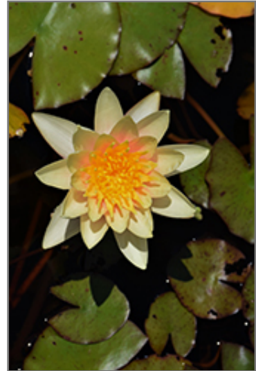
Comanche Hardy Water Lily flowers