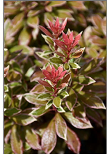
Little Heath Japanese Pieris foliage