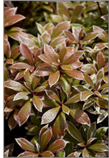
Little Heath Japanese Pieris foliage

* This is a 'special order' plant - contact store for details