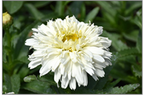
Macaroon Shasta Daisy flowers