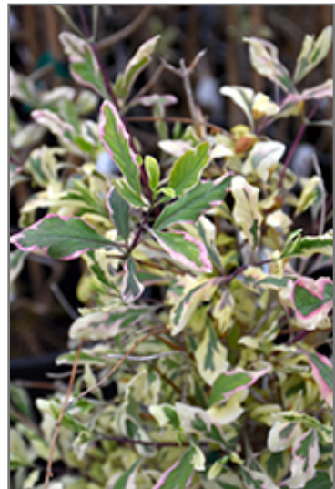
Harlequin Honeysuckle foliage