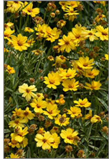
Tequila Sunrise Tickseed flowers